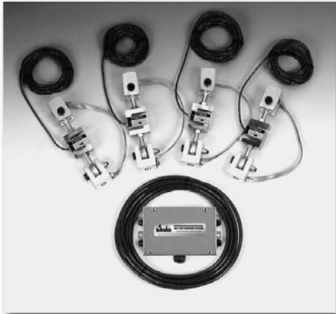
Available in configuration with three or four mounting assemblies.