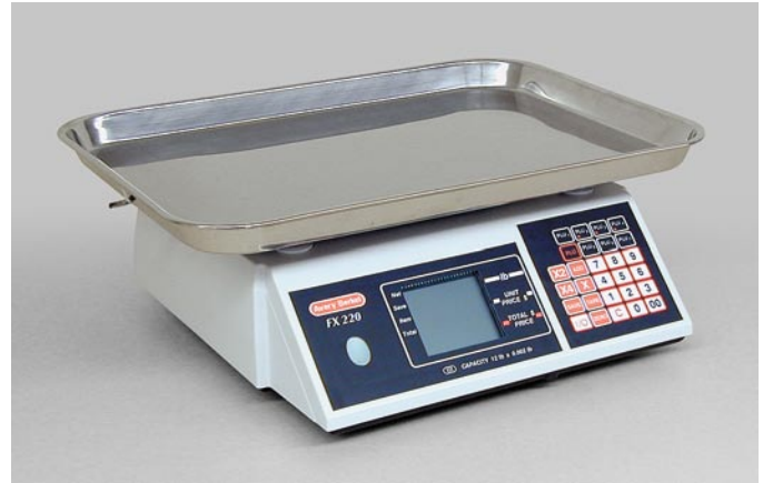
above: optional produce/fish tray left: optional customer tower