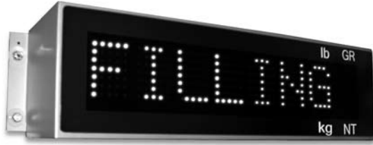
SURVIVOR LaserLight M-Series 8-character display 12-character display also available