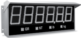
LaserLight 6 in digit shown with visor