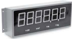
LaserLight 4 in digit