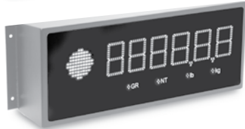
LaserLight 4 in digit with stop and go lights