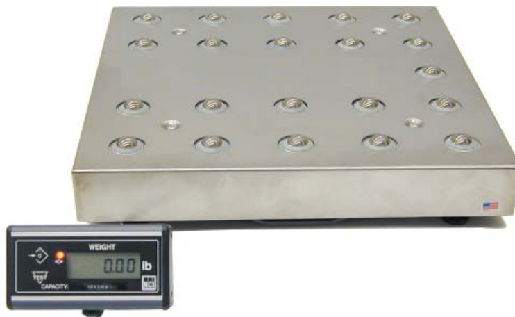
NCI Model 7885 shown with optional ball-top weight platter