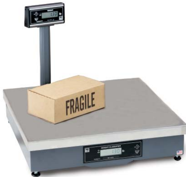
NCI Model 7829 shown with standard flat shroud and optional remote post display.