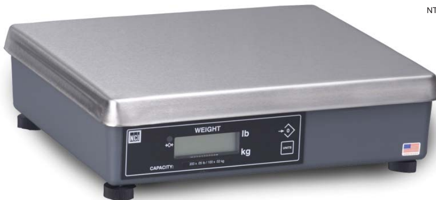
NCI Model 7821 shown with standard flat shroud