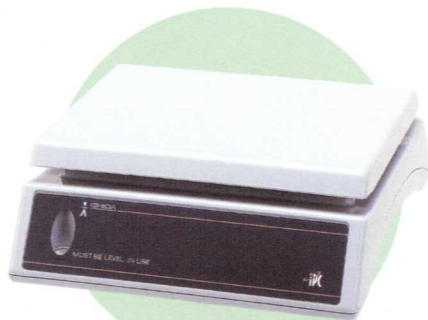
Dual Display Model