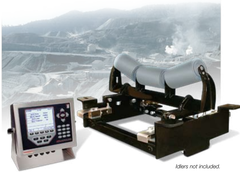
Idlers not included.