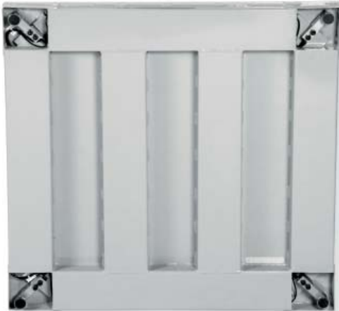
Wide channel design for superior durability