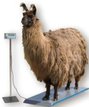
PS1000 shown with optional indicator stand