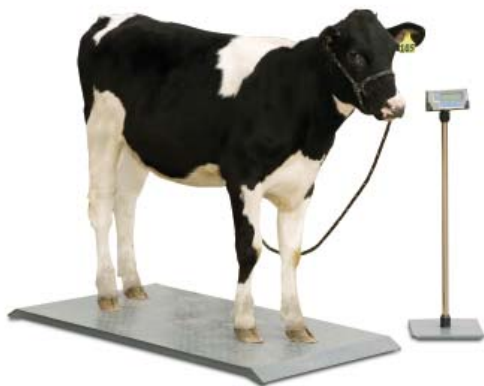
PS2000 shown with optional indicator stand

Easy Assembly – No installation costs or parts that require maintenance. Just place the scale on a hard surface and level by adjusting the foot pads. Connect the indicator and turn on the power.