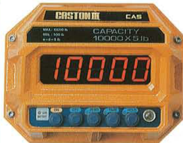
▲ Display & Keyboard