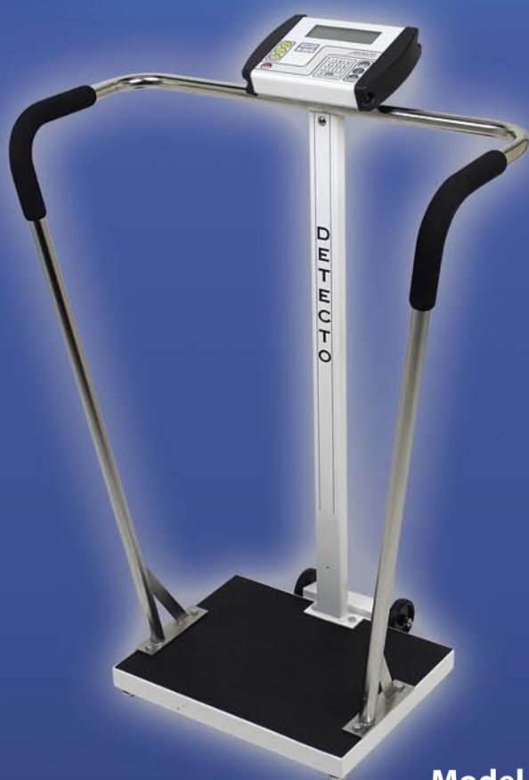
Model 6855 Waist-High Stand-On Scale 600 lb x .2 lb / 270 kg x .1 kg