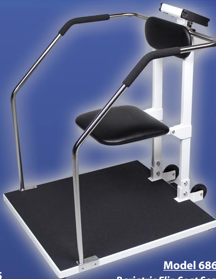
Model 6868 Bariatric Flip Seat Scale 800 lb x .2 lb / 300 kg x .1 kg