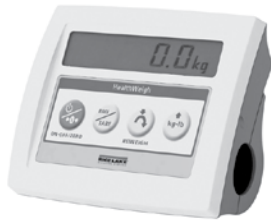
Bariatric/Handrail scale indicator