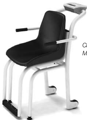
Chair Scale Model 540-10-1