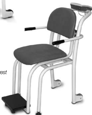
Premium Chair Scale with footrest Model 540-10-2