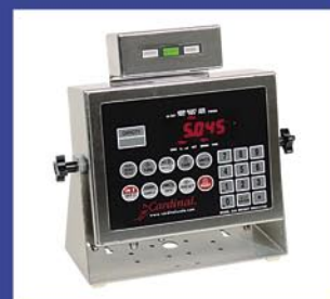
Optional checkweigher light bar for model 210.